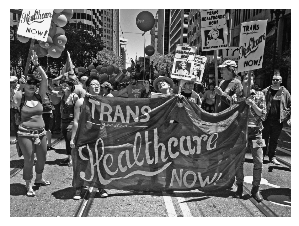
Trans Healthcare Now (San Francisco Pride March, June 24, 2012).

kind of transgender care but will pay for hormone prescriptions if the hormones could be used for other purposes than transitioning.